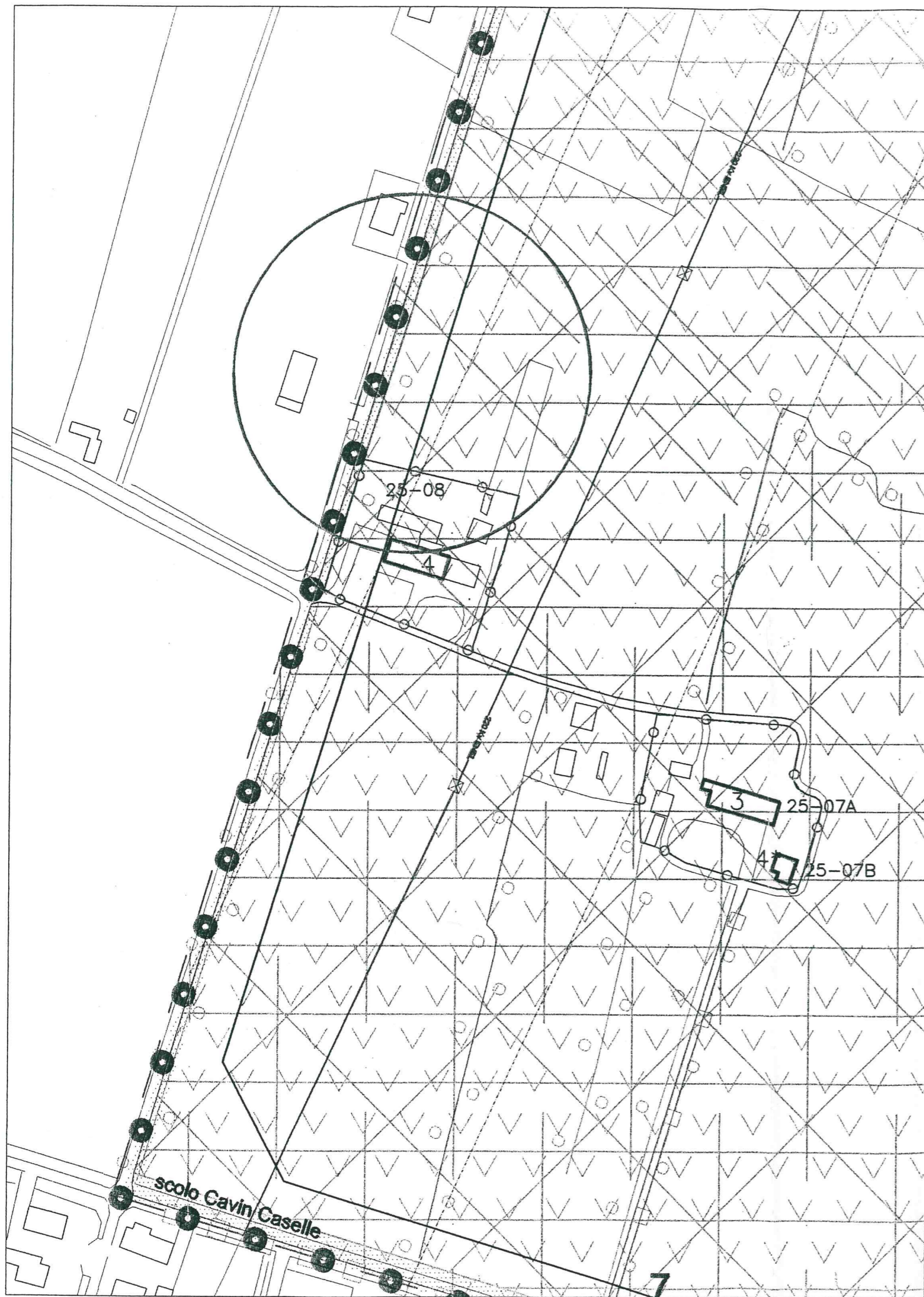
Scheda n° 1